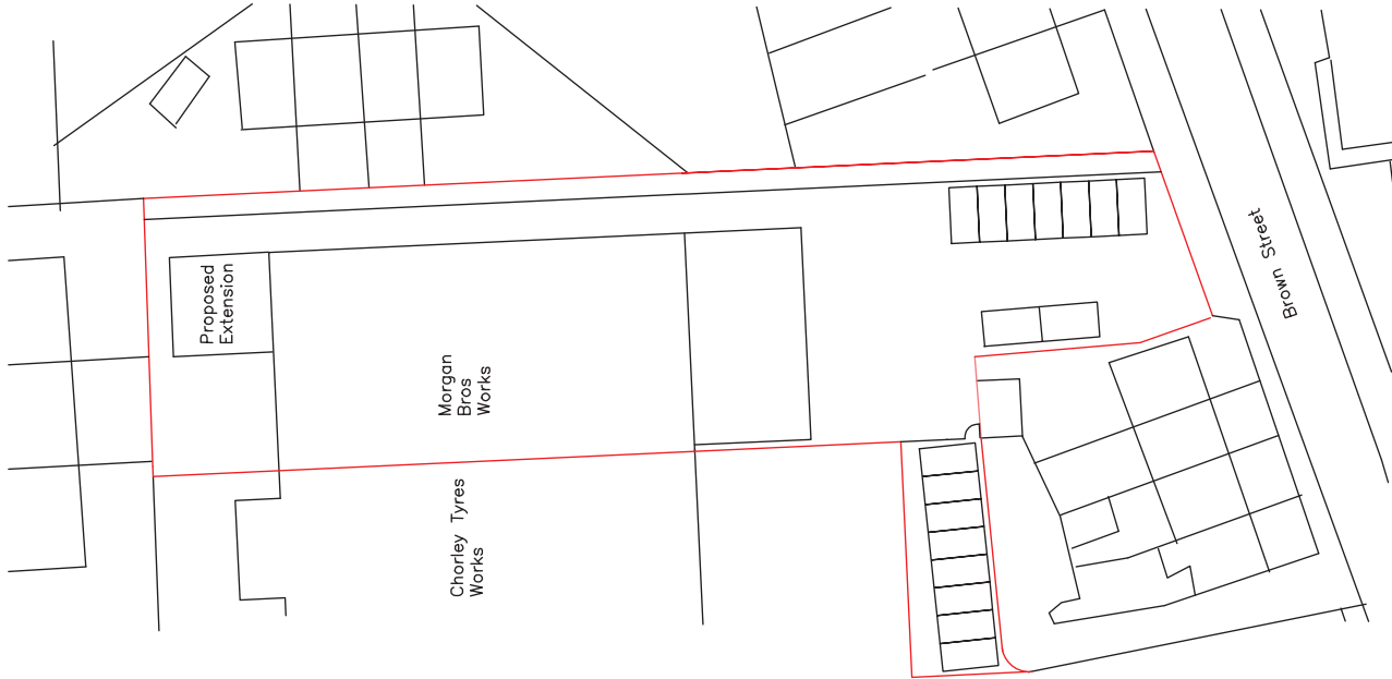
BLOCK PLAN Scale 1/500